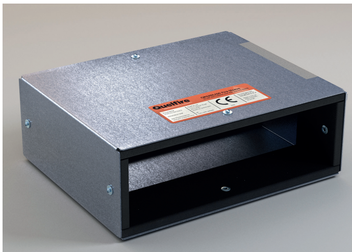
QRS CE Marked Intumescent Fire Sleeve - rectangular

QRS CE Marked Intumescent Fire Sleeves prevent the spread of fire where plastic pipes or plastic ducts penetrate fire compartment walls.