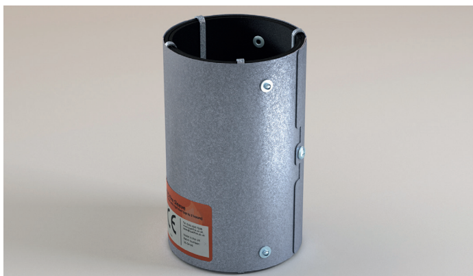
QRS CE Marked Intumescent Fire Sleeve - circular

The QRS Fire Sleeve can also be installed within the QuelStop Fire Batt.