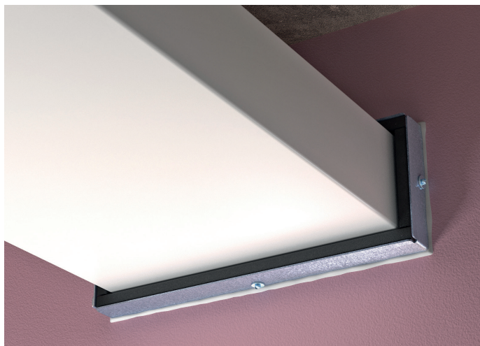
QRS CE Marked Intumescent Fire Sleeve installed in plasterboard partition