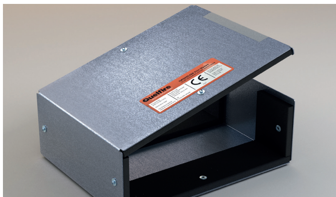
QRS CE Marked Intumescent Fire Sleeve - rectangular (open)

WARRANTY The Company warrants its products to be free from defects in material and workmanship for a period of 12 months from the date of delivery. The Company's obligation under this warranty is limited, as its option, to the repair or replacement, free of charge, or refund of the net Invoiced price of any part found to be defective, and which, in the Company's opinion, has not been subject to undue wear and tear, accident, alteration, abuse or misuse. Consequent damages are expressly disclaimed. Technical advice from Quelfire whether verbal, in writing or by way of trials, is given in good faith but without warranty. The application, use and installation of the Company's products are beyond the control of the Company, and the purchaser is solely responsible that goods are fit for any particular purpose. In line with the Company's policy of continual research and development, product specifications and availability are subject to change or withdrawal without prior notice.